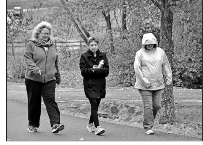
Participants in the prayer walk